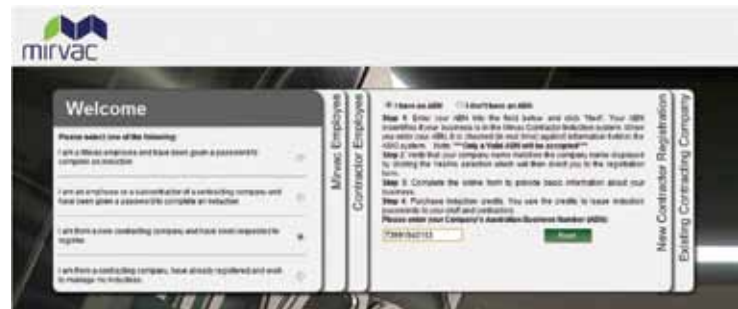
Branded Pre-Qualification screens provide a simple process for individual contractors